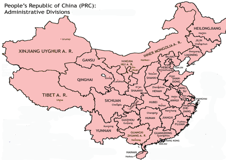
People's Republic of China (PRC): Administrative Divisions